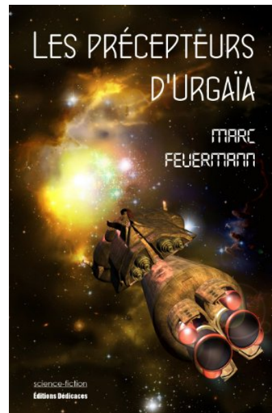
The tutors of Urgaïa